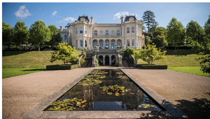
House of lord: the Beaverbrook

October 15 2017, 12:01am, The Sunday Times