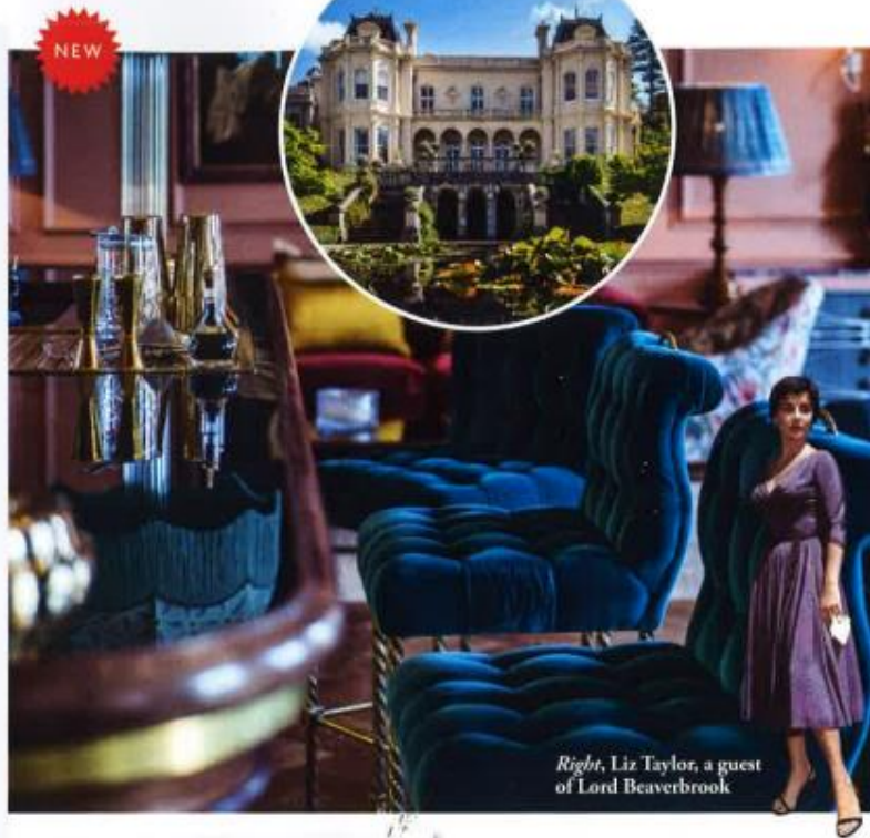
Right, Liz Taylor, a guest of Lord Beaverbrook